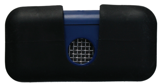
Ruggedized boot and Stand Included